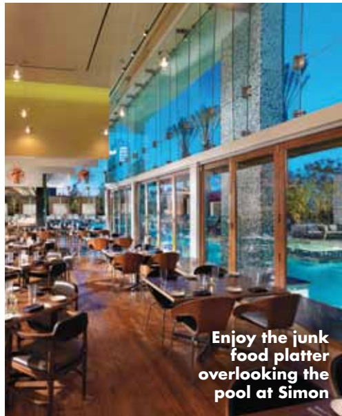
Enjoy the junk food platter overlooking the pool at Simon

My last day starts with a visit to the Mandarin Oriental, where I squeeze in a sushi-making class that takes place on the hotel's 23rd floor, from where I enjoy yet more stunning views. Then it's off to Aria for lunch at the Five50 Pizza Bar. I wash down my forager pizza with a taster menu of five specialist beers – all of which leaves me ready for a snooze on my flight home. It's been an amazing trip, but I think a post-Vegas detox is the order of the day now I'm back in Blighty!