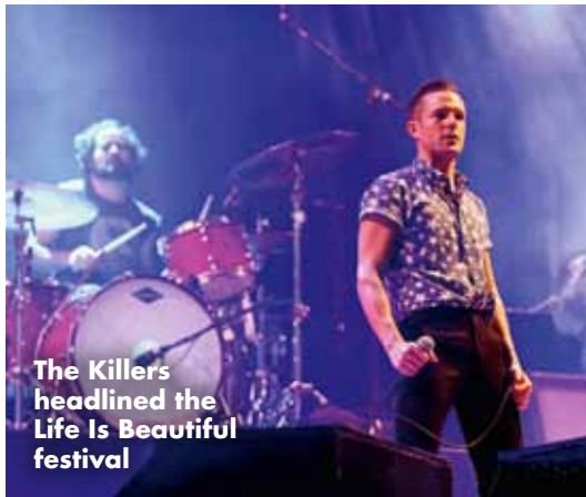
The Killers headlined the Life Is Beautiful festival

new favourite drink. It's so full of strawberry goodness that it's practically a smoothie – well, if it wasn't for the Jack Daniel's! Next I head up to Ghostbar on the 55th floor of the hotel's Ivory Tower, where I find loud music, costumed performers (the woman on stilts is particularly impressive) and some incredible city views. From there I move on to La Cave Wine & Food Hideaway at The Wynn, where I enjoy tiger shrimp, ahi tuna, salt-roasted beetroot with goats cheese and, my favourite, mushroom grits with pecorino cheese.