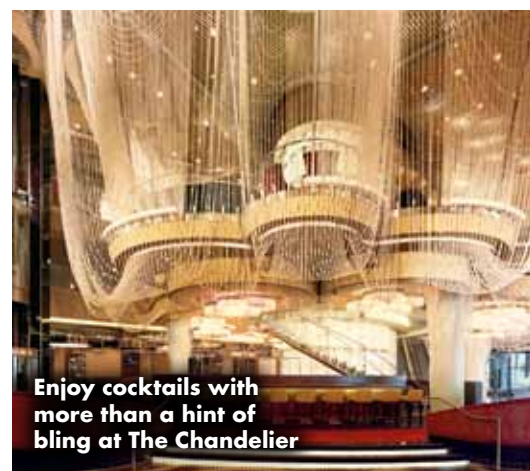
Enjoy cocktails with more than a hint of bling at The Chandelier

Cocktail bars are omnipresent in Vegas, so I have plenty of places to try. First, I plump for the Vesper Bar at the Cosmopolitan, where I sink into a comfy chair and gaze up at the striking ceiling design inspired by Alice In Wonderland's petticoat and order a Lanced Winter, a festive creation with spiced pear and a splash of orange, cinnamon