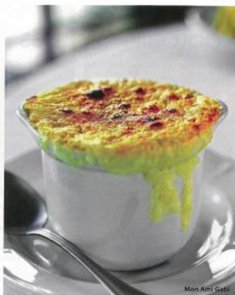
Mon Ami Gabi