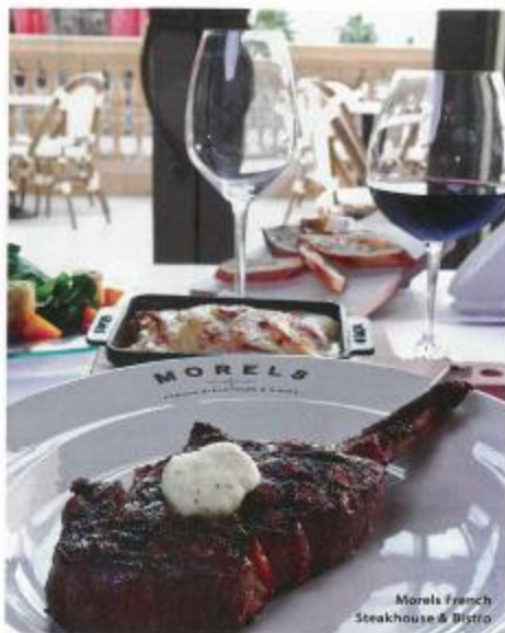
Morels French Steakhouse & Bistro